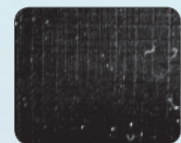
▲ Silky Texture