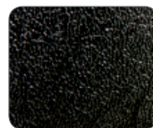
▲ Leather Texture