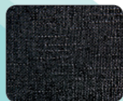
▲ Linen Texture

Various embossing effect for high value added products