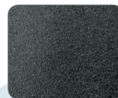
▲ Sparkler Texture